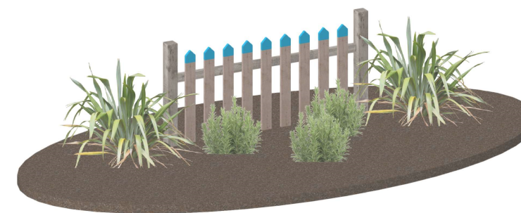
Modular Picket Fence

Compacted crusher dust pathway for easy of access.