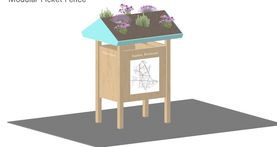
Trailhead Signboard/Book Exchange