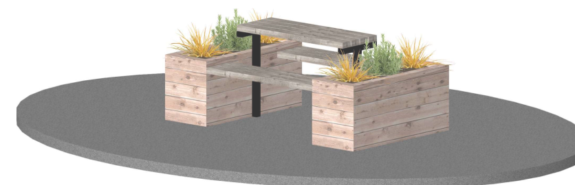
Planter Pinic Table