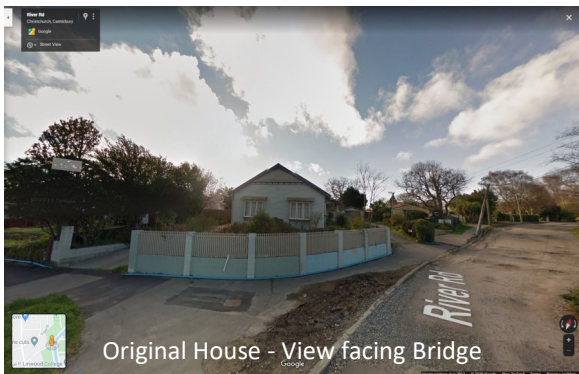
Original House - View facing Bridge