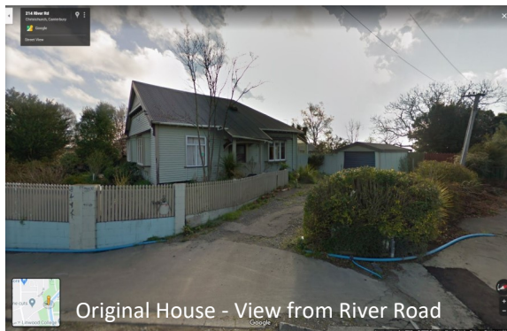
Original House - View from River Road